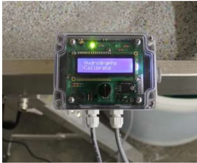
Main menu screen

Press the knob on the controller to access the main menu. Turn the knob to navigate through the menu options. An arrow indicates menu position. Select an option by pressing the knob on the controller.