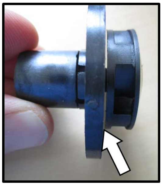
Page 2 of 3 JK_10/18