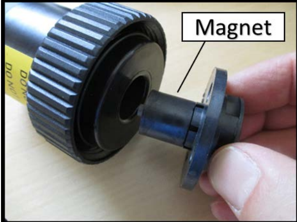
5. Clean all parts by rinsing with water. Make sure the narrow gaps around the impeller are clear of debris.